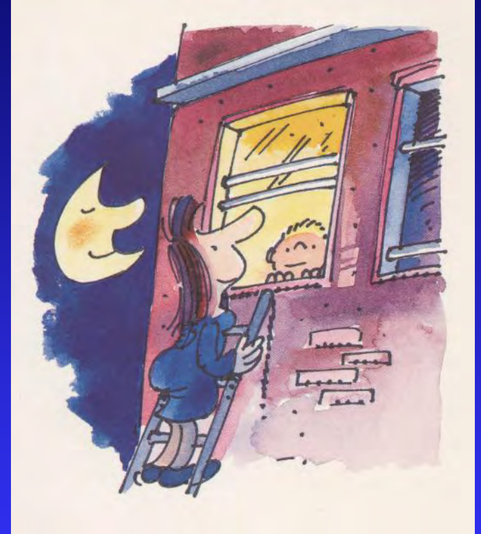
European Association for Children in Hospital