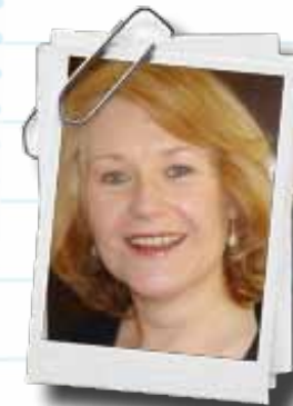
Chief Executive Officer

Finally, I would like to thank you our readers for your support and I wish you well for the holiday season ahead and for a happy, healthy and safe 2011.