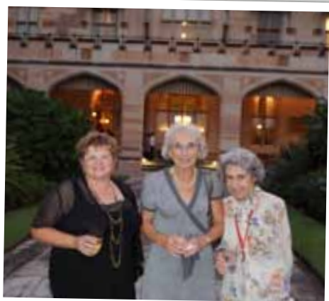
Ward Grandparents at our Reception at NSW Government House in March